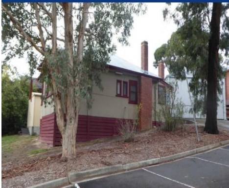
Diamond Valley Gem Club Inc.